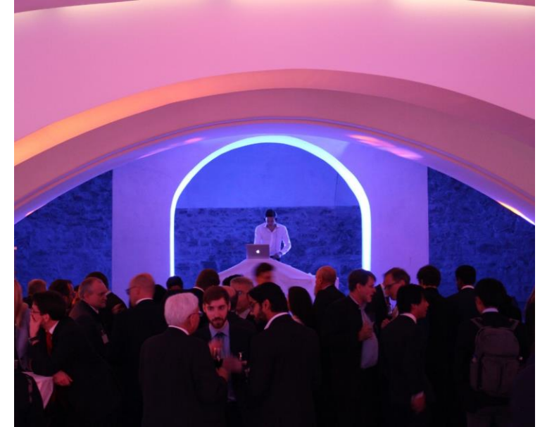
Open House Night