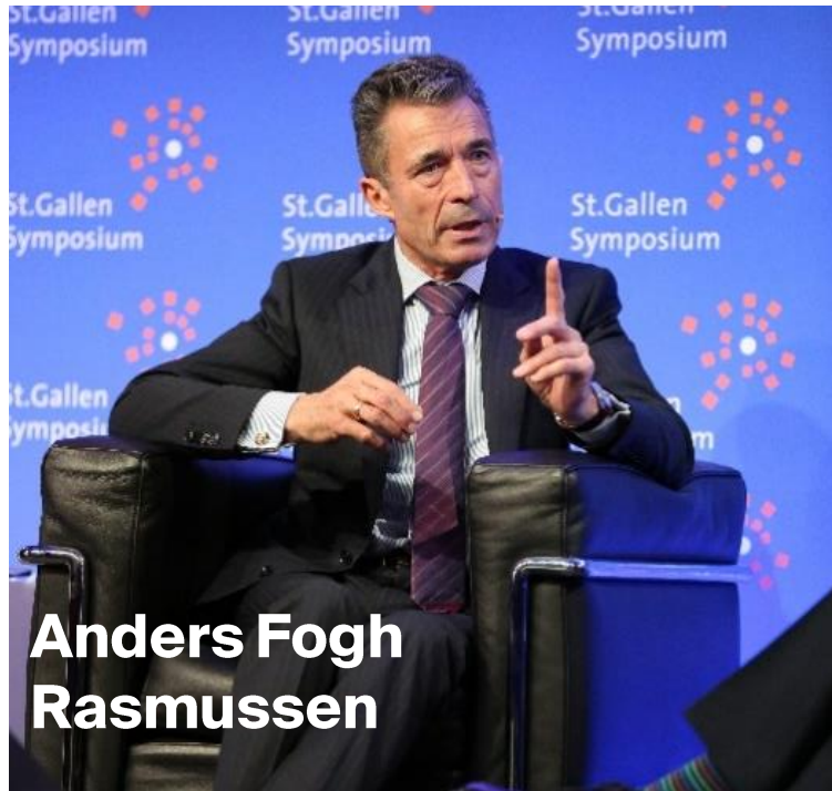
Anders Fogh Rasmussen