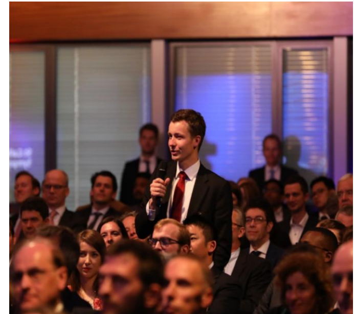
Student idea input