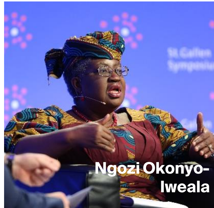
Ngozi Okonjo- Iweala