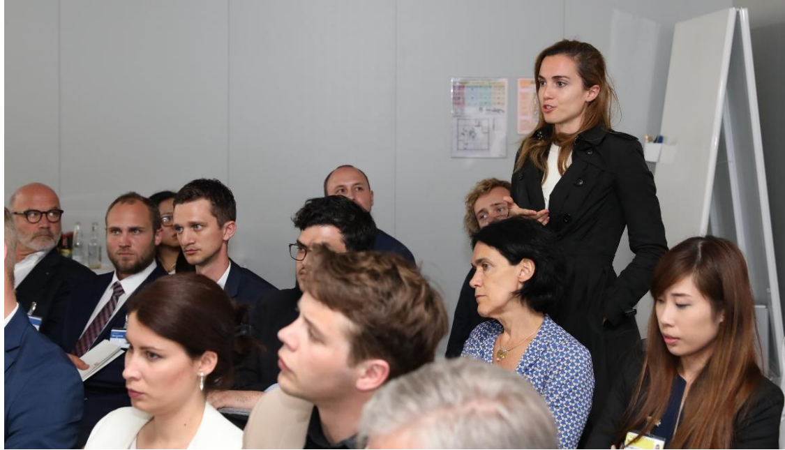
Open exchange of opinions